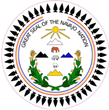
Navajo Nation Seal